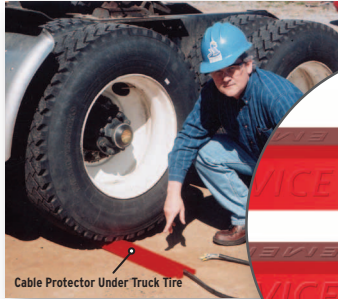
Cable Protector Under Truck Tire